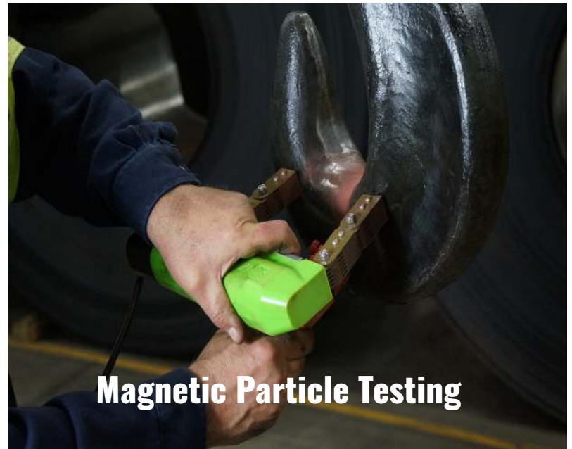
Magnetic Particle Testing

Nondestructive Testing (NDT) is a quality control inspection that does not damage or destroy the materials or objects being tested. It's the most reliable way to test equipment for defects from fatigue, structural flaws, and other problems that could lead to serious injury and or the costly shutdown of your facility.