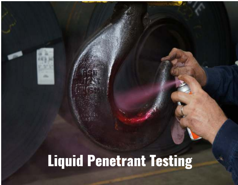
Liquid Penetrant Testing