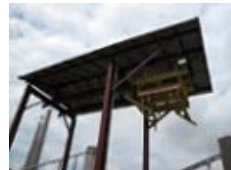
Enlarge Image Wedge and funnel test

OSHA Offers No Easy Answers on Crane Regulation By Lucy A. Perry >more