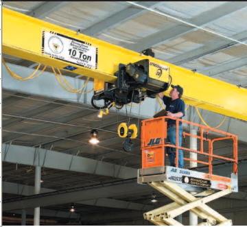
Crane Inspection and Maintenance

The death at V&S Detroit Galvanizing is especially bothersome to the Hoosier Crane staff because this accident could have been avoided (see other side of this flyer for the complete story). Achieving a safe workplace doesn't have to be expensive or time-consuming, especially compared to the consequences of an accident. Call us today to learn more about the following safety solutions.