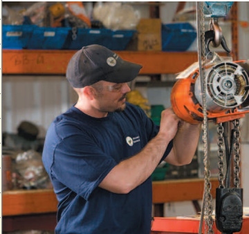
Hoist Inspection and Maintenance

We use OSHA 1910.179, ASME B30.2, NEC and other applicable standards to accurately perform and document your crane inspections. We can provide maintenance and repair, if needed.